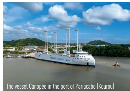
The vessel Canopée in the port of Pariacabo (Kourou)